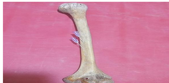
Figure 4: Double nutrient diaphyseal foramen on anterior border