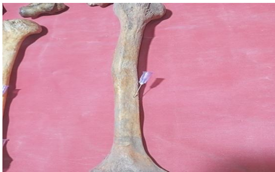
Figure 2: showing single nutrient foramen in the middle of the humerus