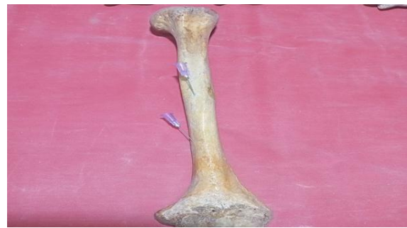
Figure 3: Double nutrient diaphyseal foramen on its anterior and antero-medial surface.