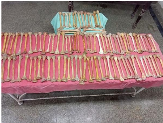
Figure 1: Adult Humerus bones with normal morphology were displayed.

The nutrient foramen is identified for its presence of groove which is usually well-defined. A 24-gauge needle is inserted into the nutrient foramen to check its patency. The presence, number, location and its direction were recorded and tabulated. Magnifying lens is used to identify the foramen. All the foramens noted are tagged, photographed, their landmark identified and documented.